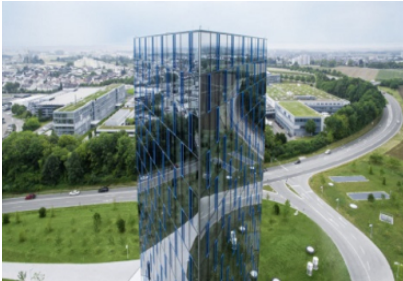
Title for image 1 Description